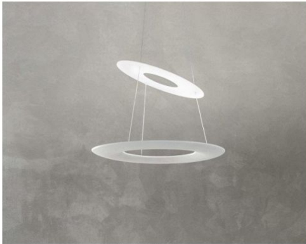
Available Versions Erhältliche Ausführungen