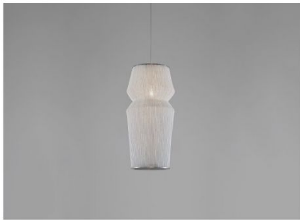
Available Versions Erhältliche Ausführungen