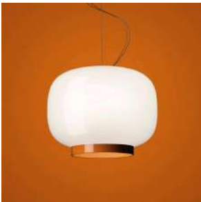
Chouchin Reverse 1