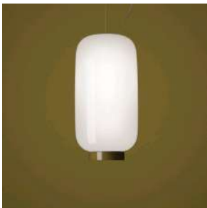
Chouchin Reverse 2