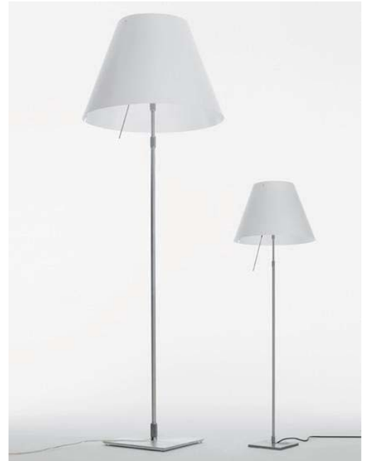
D13G t. - D13G t.i

Reference code: D13G t. 1D13GTDH0020 alu D13G t.i. 1D13GTIH0020 alu