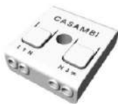
Dimmer Bluetooth, 85-240V