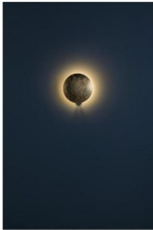
Available Versions Erhältliche Versionen