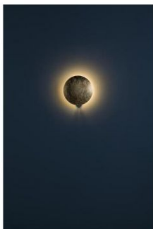
Available Versions Erhältliche Versionen